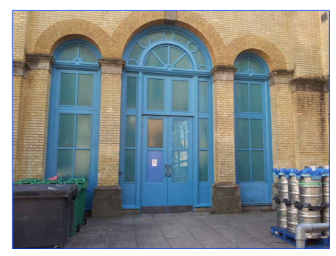
Fig.I. Restored windows to Palm Court, Alexandra Palace